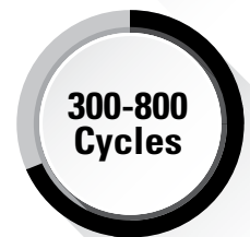
Absorbed Glass Mat (AGM) Batteries