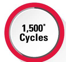
NexSys® PURE Batteries

*1200 cycles (at 60% DOD) for 38, 62 and 90 Ah models